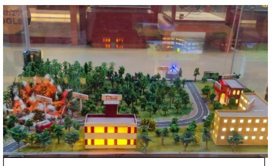
Timber Museums at Forest Research