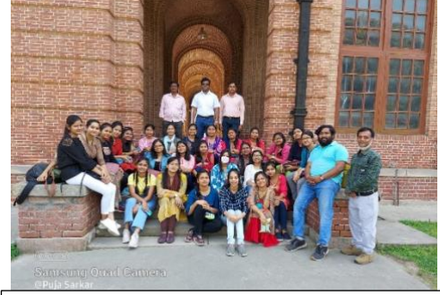
At Forest Research Institute Dehradun