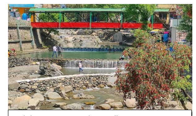
Sulphur Spring at Sahastradhara